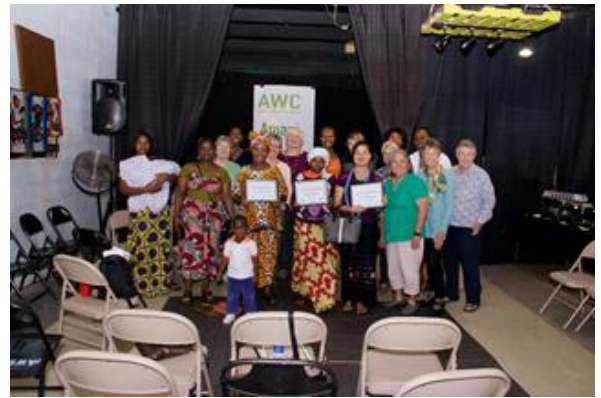
Graduates are surrounded by classmates and other guests.