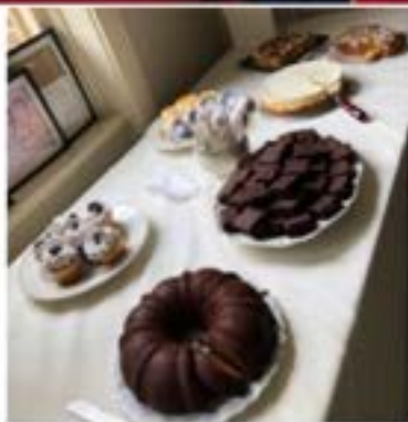
7: Luscious desserts