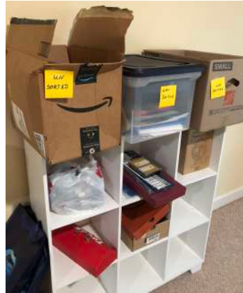
Goodies to be sorted