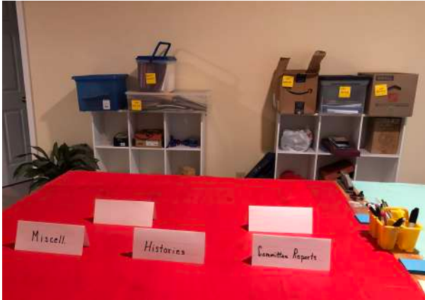
Nice and neat