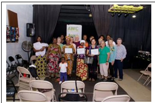
Graduates are surrounded by classmates and other guests.