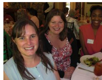
Ladies from Emory's Respect Program