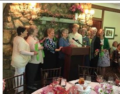
Next year's officers