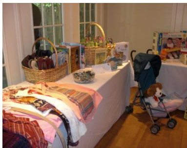
Gifts for the Amani Women's Center